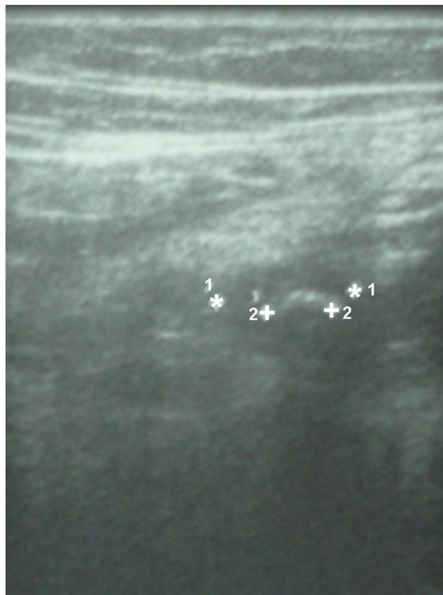
Figure 2 Ultrasonography revealing fecalith (1) into appendiceal stump (2).

Stump appendicitis is the re-inflammation of the residual appendiceal tissue after an appendectomy [1-3]. It represents a rare delayed complication of appendectomy which is unknown by most clinicians [1-7]. Its frequency is under-estimated and under-reported [4,5,7,8]. Some factors have been suggested for the development of this condition. An appendiceal stump that is left too long represents the most advocated etiologic factor [1-5,7-12]. Our patient had a relatively long stump. Inadequate identification of the appendiceal base, because of severe local inflammation, retrocecal or sub-serous appendix, has been also suggested [1,4,5,10]. Moreover, the incidence of this complication seems to increase until the introduction of laparoscopic approach, probably due to absence of tactile feedback [1,4,13]. The age of the patients ranges from 11 to 72 years with [1,2,4,14]. Only three cases are reported in the paediatric literature [1,2,14]. The time of onset ranges from 2 weeks to decades after appendectomy