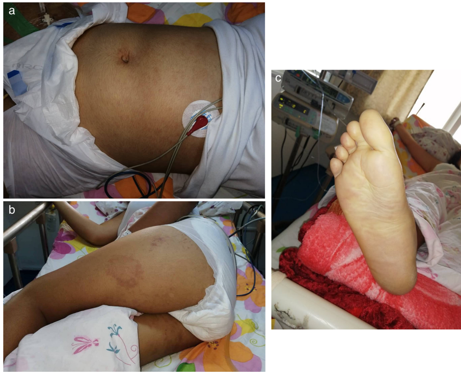
Fig. 2 Maculopapular rash in abdomen (a), thighs (b) and feet soles (c)