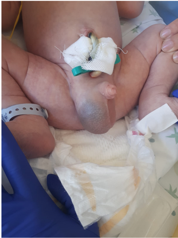
Fig. 1 Right scrotal swelling with bluish discoloration 5 h after birth

vascular spots (Fig. 2) that confirmed blood flow. The initial diagnosis was idiopathic SH.