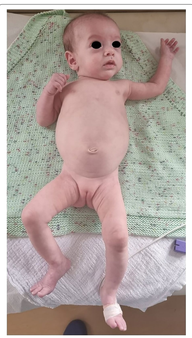
Fig. 1 Our patient at age 5 months: frontal bossing, depressed nasal bridge with rounded tip, thin upper lip, small chin, and signs of malabsorption including pale skin, sparse hair and eyebrows, globose abdomen, dystrophy of the limbs

Serra et al. Italian Journal of Pediatrics (2022) 48:205 Page 4 of 9